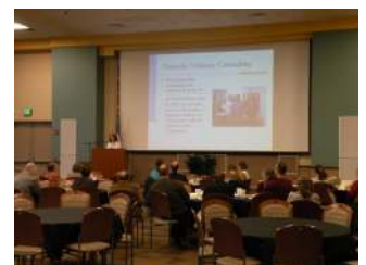
Church leaders enjoy a presentation and breakfast provided by OCR.

Thank you for all of the support on this event!